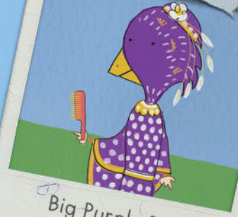
Big Purple Bird

When Pablo is scared by a picture in a café, he draws a confusing world in response and decides it is alright to be a Scaredy Cat as everyone is scared of something.