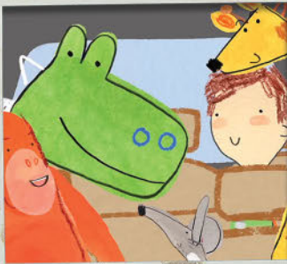
The Party Present