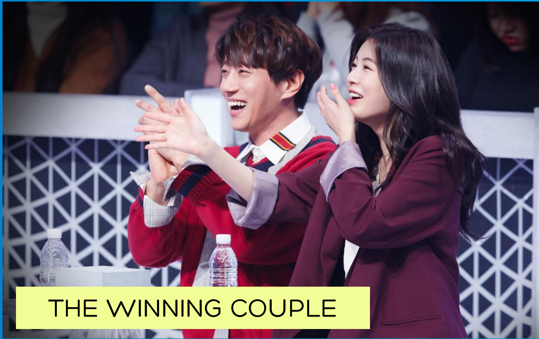
THE WINNING COUPLE

The couple who wins the final round collects DOUBLE the money they have accumulated since Round 1.